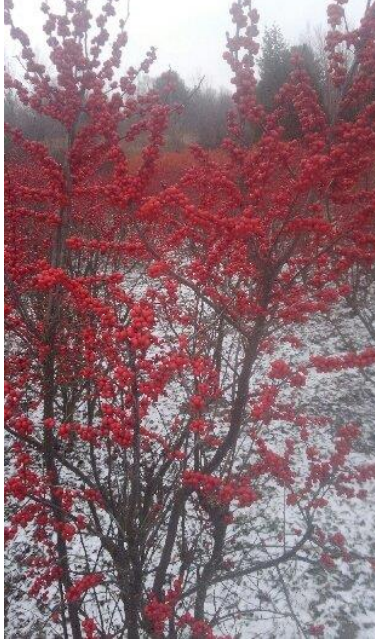
I. Vert WINTER RED