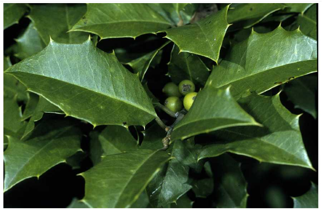
OTHER SPECIES OF HOLLIES

Quart: $30.00 Gallon: $50.00 2-Gallons: $80.00 3-Gallon: $100.00