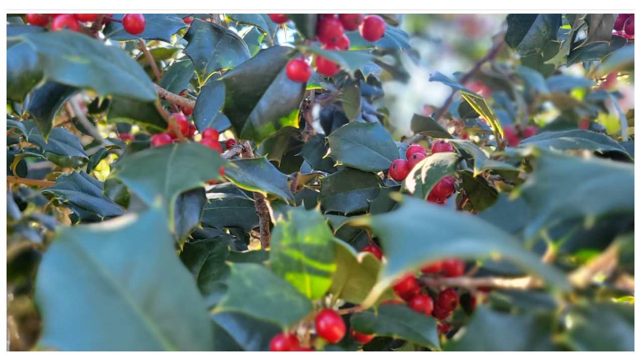
I.O. ARLENE LEACH